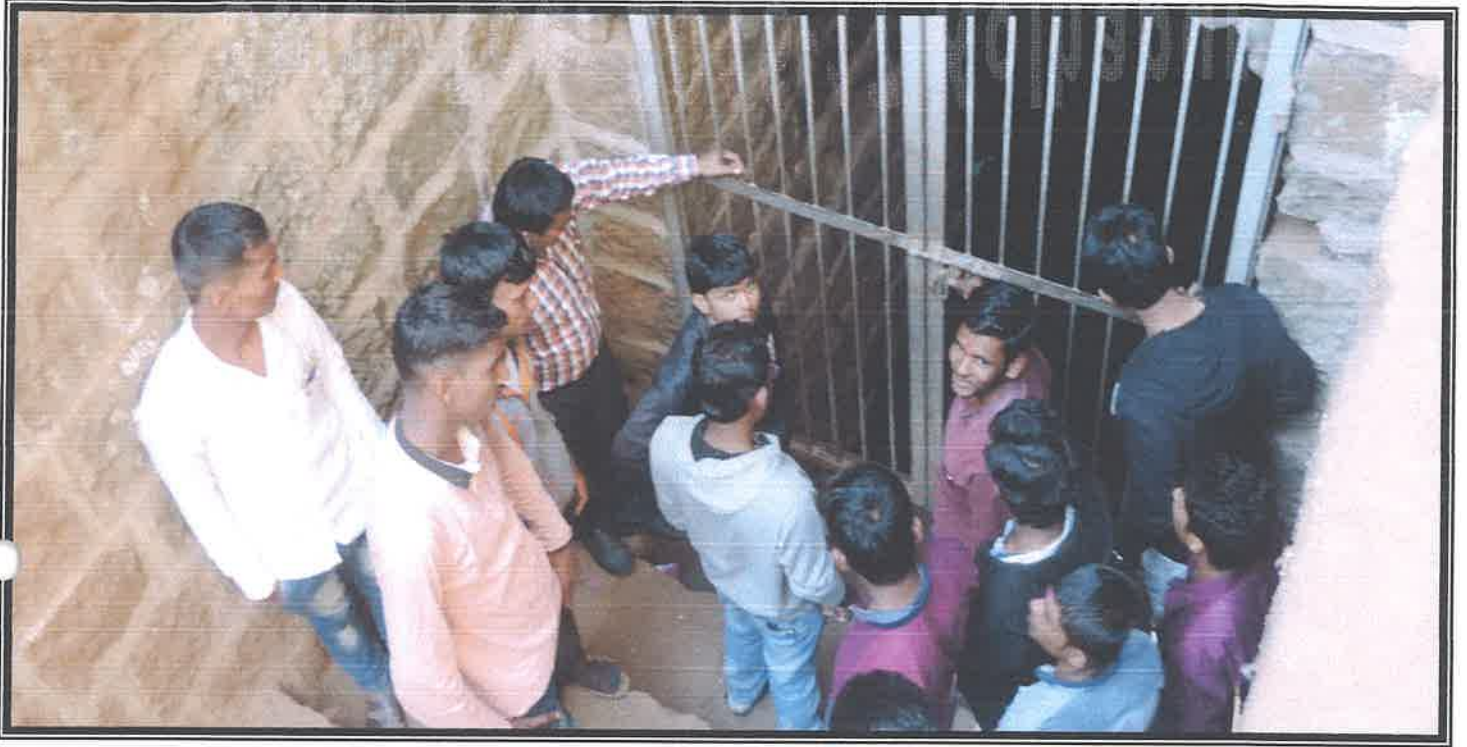
Panhala Fort Sajja Kothi